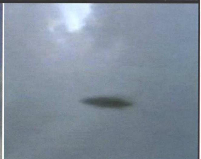
Enlargment of circled area in photo on left.

In June 29, 1999 the surveillance camera of the CENAPRED, the government agency for disasters prevention was monitoring Mount Popo taking pictures at time intervals. At 1:20PM the camera captured a strange disk shape dark object very near from the volcano crater and emerging among the smoke clouds.